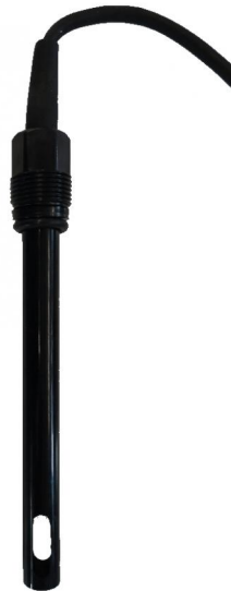
Zirkon Con 261400800